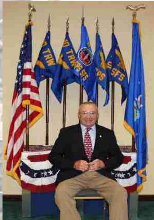
10th SPA Third Reunion June 2010